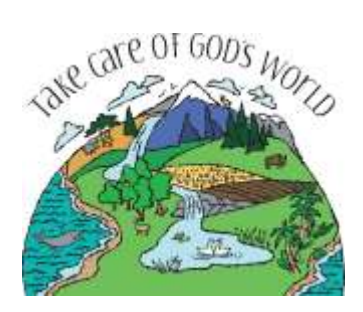
Earth Day is April 22nd